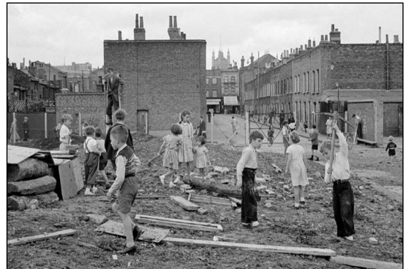
Figure 8.2: The Lollard adventure playground on the site of a bombed school. The House of Parliament can be seen across the river.

articles, and committees. A five-day conference in 1948, sponsored by the Cambridge House University Settlement, examined the first two experimental junk playgrounds, Camberwell and Morden, which had been in operation for less than a year. Junk playgrounds received extensive press coverage, demonstrating that their visibility was in inverse proportion to their quantity. This visibility was not accidental. The Lollard adventure playground was intentionally sited near the Houses of Parliament. Allen, who chaired the playground committee, intended it to be a demonstration playground for visiting members of Parliament (Figure 8.2). 23