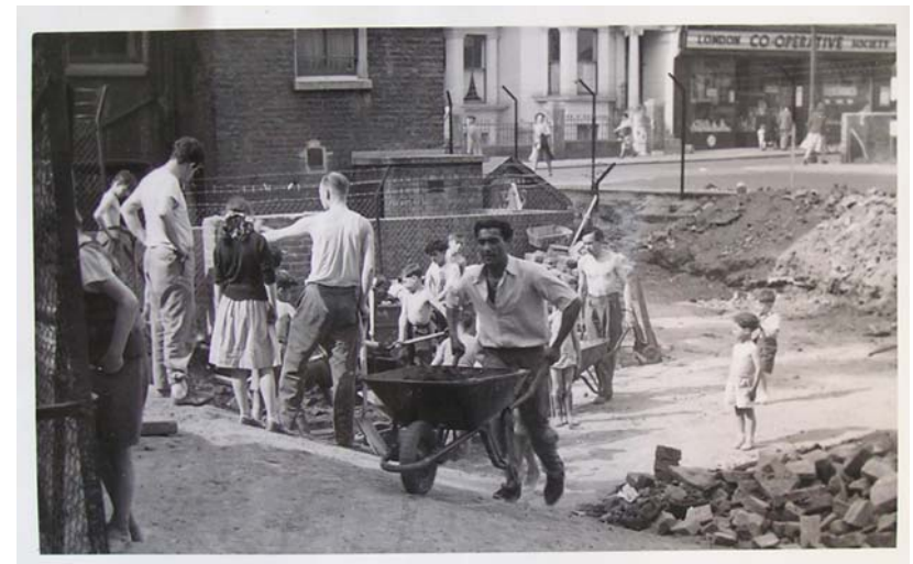
Figure 8.3: The Clydesdale Playground, 1952

principles. The plan dealt extensively with the place of the child in the city by dividing the metropolis into self-sufficient neighborhood units organized around the school and the playground. 25 Allen advanced the more modest suggestion that reconstruction ought to be incremental and pragmatic. Yet her truly radical proposition was that reconstruction should be carried out with the participation of the population. Adventure playgrounds were to be developed out of local initiatives by parents and were to be built by children themselves with the help of voluntary organizations. Playgrounds operated as independent associations that were headed by committees, whose members included residents, pedagogues, social workers, local politicians and, in some cases, members of the local clergy.