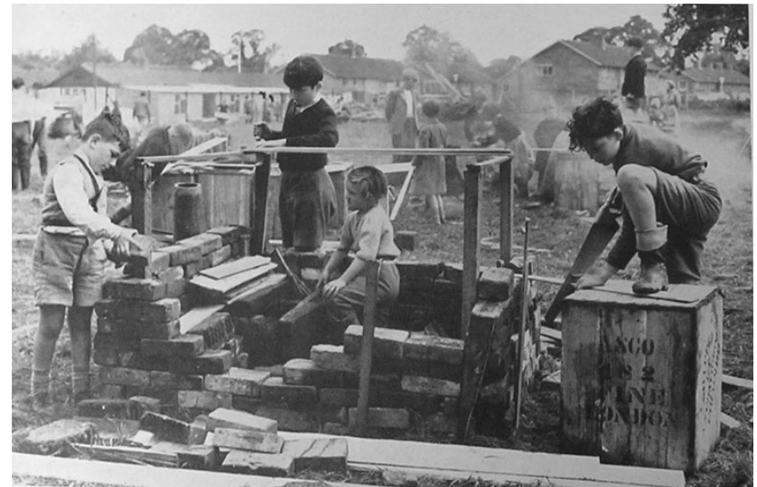
Figure 8.5: Crawley Adventure Playground, 1955.

Yet the adventure playground's democratic and participatory model of collectivity, as well as its pacifism, was rooted in a psychological notion of political citizenship. The policy of autonomous free play was predicated on the not-so-liberal notion that society has the right, even the obligation, to know and govern the interiority of its subjects, since social cohesion and stability were deemed dependant on the emotional equilibrium of each individual member.. In this respect, the adventure playground confirms Rose's claim that the welfare state governs subjects from the inside, by inducing them to change their everyday conduct to act as active citizens, ardent consumers, enthusiastic employees, and loving parents, as if they are realizing their own intimate desires. 49 The playground was one of these institutions where children were made into subjects, precisely because in play they felt themselves to be autonomous and free.