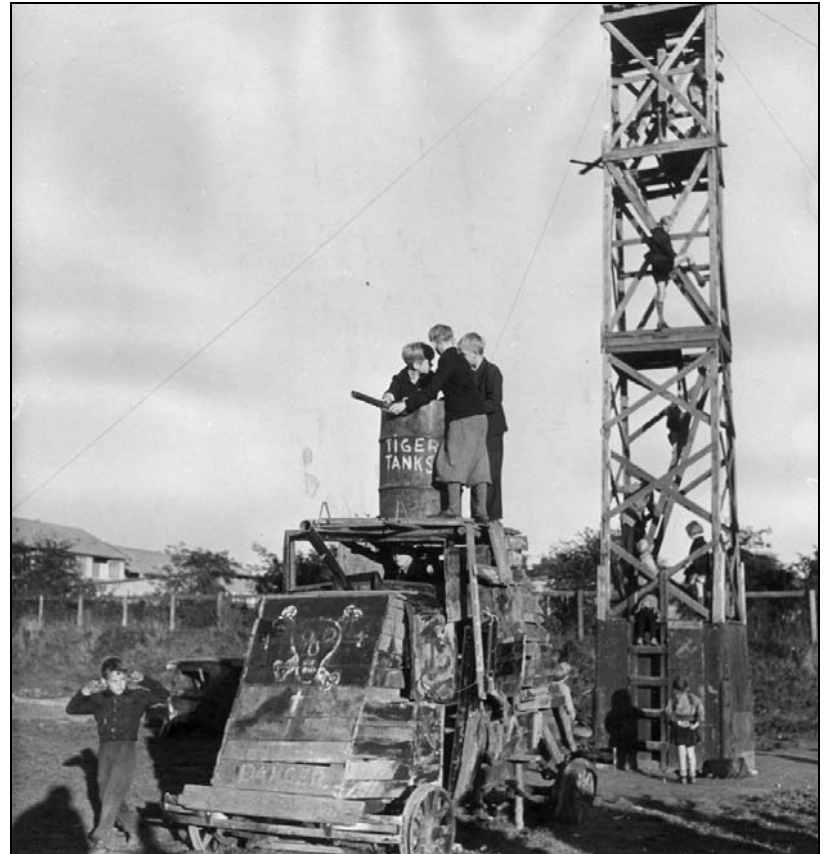
Figure 8.1: “War Games”: Photo taken by Francis Reiss to illustrate Lady Allen of Hurtwood’s essay in Picture Post , November 16, 1946.

The essay began with a critique of the conventional playground, arguing that it failed to attract children and remove them from the street. Allen claimed that this failure was literally a matter of life and death: